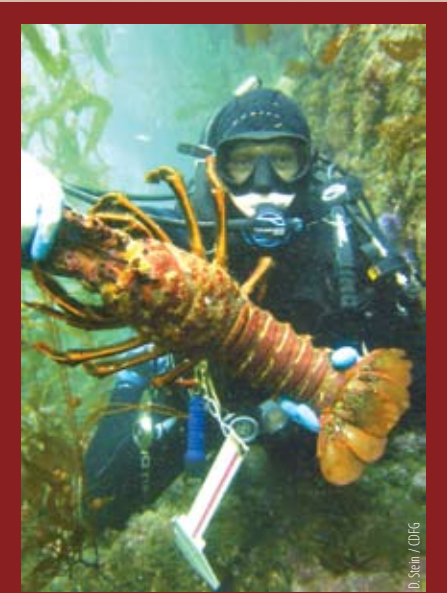
Scuba diver displays a California spiny lobster. When attempting to capture lobster, avoid grasping the legs or antennae as lobster that escape with broken appendages produce fewer offspring while recuperating.

Among the more than 40 species of spiny lobsters known worldwide, the California