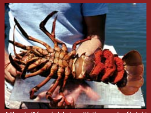
A "berried" female lobster with thousands of bright orange eggs attached to the swimmerets on the underside of her tail.

Spiny lobster usually move into shallow water during spring and summer, and migrate to deeper water in fall and winter. Adult lobster have been found as deep as 240 feet during the winter, possibly to avoid the effects of stormy weather.