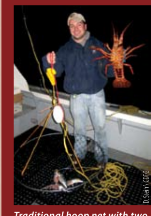
Traditional hoop net with two large metal rings joined by collapsible mesh netting.

Use an oily or aromatic bait to disperse a scent trail that nearby lobster can follow back to the net. Common baits such as squid, Pacific mackerel, bonito, anchovies, sardines, and even meats like raw chicken are proven lobster attractants. Perforated cans of cat food are another option. Invest in a wire mesh bait container to guard against loss of bait to fish or other large predators such as seals and sea lions.