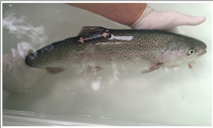
An adult steelhead with a “geolocation” tag that detects Earth’s magnetic field and daylight, allowing researchers to estimate the fish’s position at sea within a 60-kilometer radius.

The Sacramento River steelhead trout ( Oncorhynchus mykiss ) is a threatened species whose numbers are supplemented by the release of captive-bred juveniles. Each year, the Coleman National Fish Hatchery alone produces 600,000 yearling steelhead smolts and releases them into Battle Creek, a tributary of the upper Sacramento River. Smolts are young, silver trout (or salmon) that are ready to migrate to sea for the first time. The hatchery operations are mitigation for loss of natural steelhead in their historic spawning grounds. Coleman is one of several hatcheries in the Sacramento River basin that cultures steelhead for mitigation purposes.