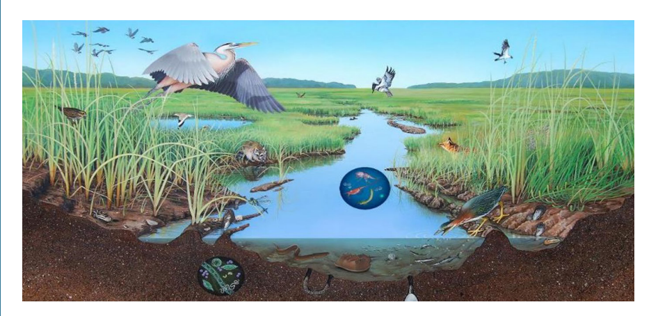
An illustration of a coastal wetland ecosystem. Credit: Barbara Harmon.

Reevaluating ecosystem functioning and carbon storage potential of a coastal wetland through integration of lateral and vertical carbon flux estimates