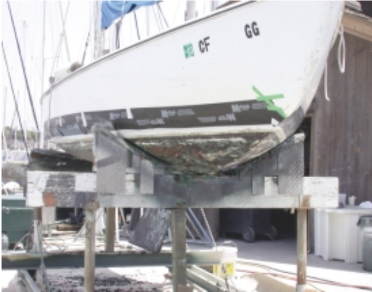
Stripping Old Copper-Based Bottom Paint

Boatyard operators in the San Diego region have some experience with applying nontoxic bottom paints on recreational boats. Although they believe that one-fourth of the boaters in the San Diego region are aware of nontoxic bottom paints, only a few boaters have requested these products. Epoxy- and silicone-based coatings are the most commonly applied nontoxic bottom paints in San Diego boatyards.