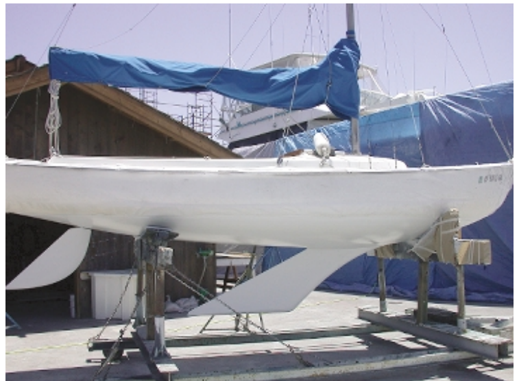
Sailboat with New Nontoxic Bottom Paint

In response to the high copper levels in southern California harbors and bays, the San Diego Regional Water Quality Control Board and the U.S. EPA are conducting Total Maximum Daily Load programs for Shelter Island Yacht Basin in San Diego Bay (SDRWQCB 2001) and Newport Bay (U.S. EPA 2002b) to determine how much copper is present and how much can be allowed. Technical studies have been completed and regulations to reduce copper levels are being planned. Regulations will probably include nontoxic paints as an alternative for reducing copper pollution from boats.