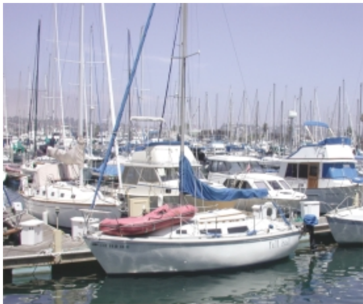
Shelter Island Yacht Basin, San Diego, California

In evaluating toxic effects of dissolved copper from bottom paints, it is important to consider the "big picture." Marine life in marina and harbor waters experience the cumulative effects of spilled lubricating oil, diesel, gasoline, cleansers, varnish, garbage, trash, sewage, zinc, copper, other pollutants from boats and those carried by storm drains. Increasingly, boaters are acting to cut releases of all forms of pollution and they will ultimately benefit from their actions!