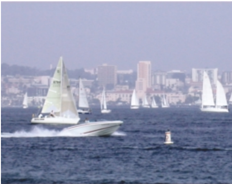
Sailing San Diego Bay

As boat owners shift to nontoxic coatings, copper releases to boatyards and to harbor sediments will fall. This should reduce environmental compliance costs for boatyards and harbor authorities. These savings may be passed to boaters.