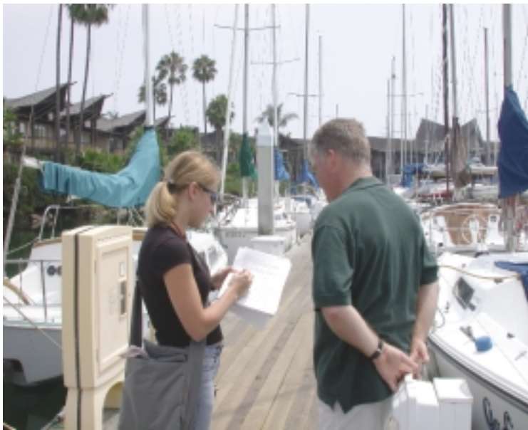
Interviewing Boat Owner About Bottom Paints