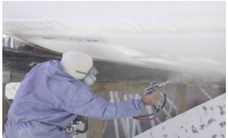
Sprayer Application of Nontoxic Bottom Paint

A nontoxic paint, or coating, must be able to withstand more frequent and possibly more aggressive cleaning. Because it does not depend on the lifespan of copper, a durable, nontoxic paint may last longer than a copper-based paint. This would allow more time between haulouts and repainting and make up for extra hull cleaning costs. Nontoxic coatings are relatively new, so their actual lifespan, cleaning schedule and difficulty, and the cost of haulouts for safety inspections and topside work will need to be determined during the next few years.