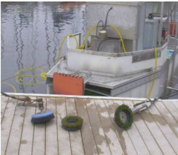
Powered Scrub Brushes for Underwater Hull Cleaning

Bottom paint needs to be cleaned often enough to remove early stages of fouling growth. Once fouling organisms reach a certain stage, they begin to harden, develop a stronger hold and may penetrate and scar the paint. Then, more aggressive scrubbing is needed that may further damage or wear away paint. (Hoffman 2002) To avoid these problems, boat owners in the San Diego region commonly have a diving service clean copper-based bottom paint every four weeks. In summer many boat owners step up the cleaning schedule to every 3 weeks.