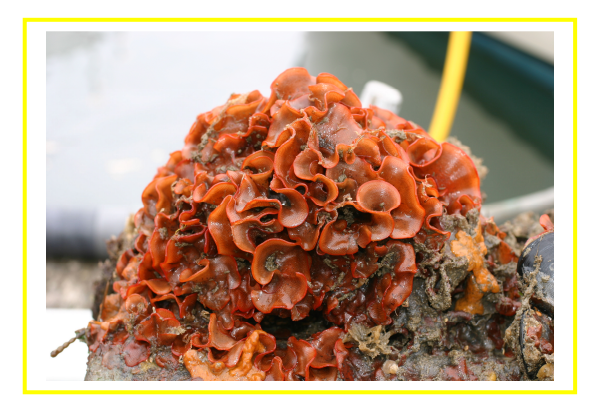
Bryozoan (Watersipora subtorquata)

Tubeworms ( Hydroides sp. ) and Sea Squirts ( Ciona sp. )