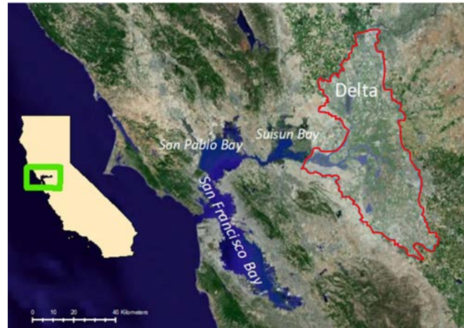
Location Map: Sacramento-San Joaquin Delta

The Sacramento–San Joaquin Delta (Delta), along with the San Francisco Bay, is part of the largest estuary on the West Coast. The Delta provides vital habitat for endangered and endemic species and is the portal through which important fish species, including anadromous Chinook salmon, pass on their way to and from their spawning grounds. The Delta is a major stop on the Pacific Flyway as well as the hub of the State’s water supply system, supplying two-thirds of California’s water supply. Thus, the Delta is inextricably linked to statewide water supply issues that affect its ability to function as a natural ecosystem.