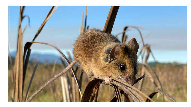
A salt marsh harvest mouse perched on alkali bulrush in Marin County.