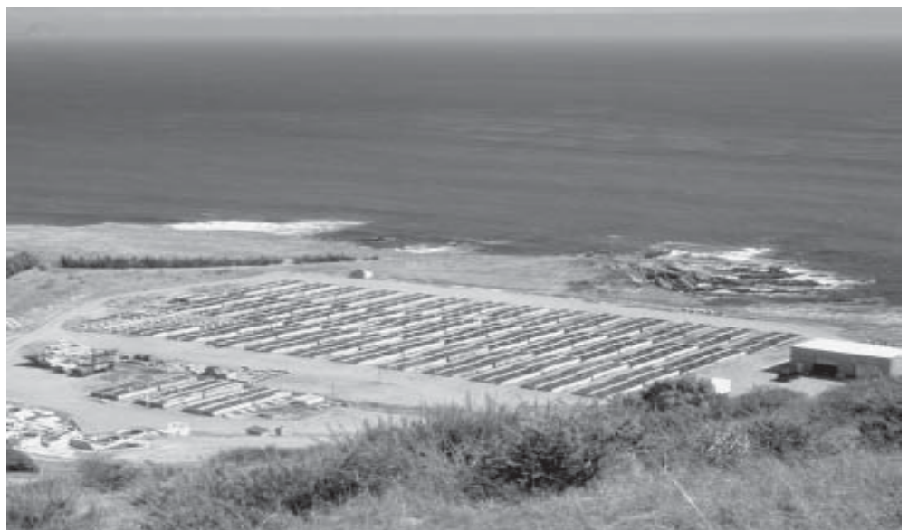
At any given time, The Abalone Farm, Inc. in Cayucos, California, may have about 2 million abalone growing in concrete tanks along the coast. The company is working with scientists to develop oral antibiotic therapies for treating withering syndrome.