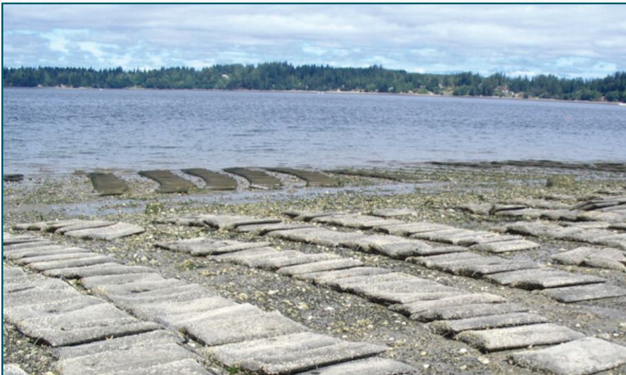
Sample oysters at Totten Inlet, Wash.

The scientist began his research in the summer of 2007 in Shelton, Washington, a location historically known for having high rates of oyster mortality. He travelled to the location at 2-3 week intervals from June to August, using what he called an "innovative repetitive sampling approach" to test the oysters for SMS, without impacting their survival.