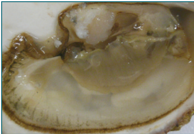
The inside of a Pacific oyster.