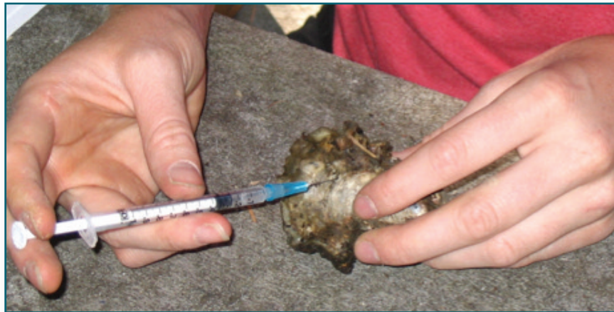
Hemolymph testing technique being conducted on an oyster.

of SMS. Through communication with other researchers and farmers, he found that mortality was relatively low overall in 2007 and 2008. Though these data would have been more compelling had there been more oyster deaths, the scientist believes that his analysis will help identify the root causes of the syndrome.