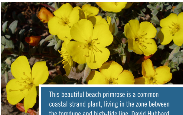
This beautiful beach primrose is a common coastal strand plant, living in the zone between the foredune and high-tide line. David Hubbard