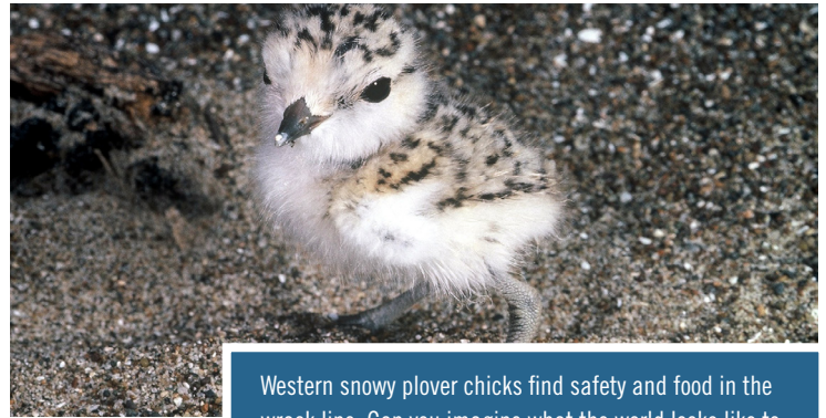
Western snowy plover chicks find safety and food in the wrack line. Can you imagine what the world looks like to this tiny chick? www.westernsnowyplover.org

In peer-reviewed research, biologists show that leaving wrack on the beach helps maintain foraging opportunities for shorebirds and benefits native coastal strand plants that trap sand and create sand dunes. In recent work, biologists estimate that about 40 percent of the animal species living on sandy beaches depend on wrack. In an ongoing project, they are studying the importance of decomposing wrack in supplying nutrients to coastal ecosystems.