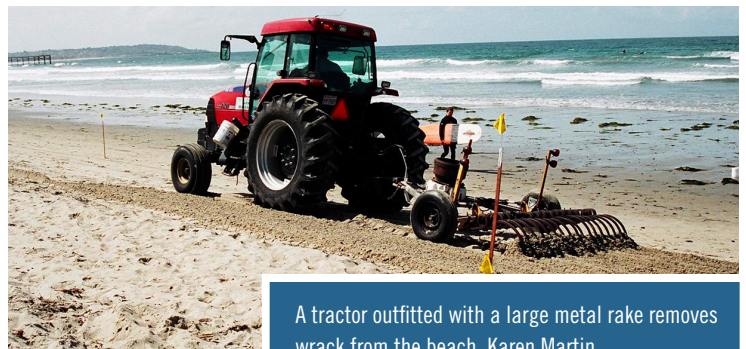
A tractor outfitted with a large metal rake removes wrack from the beach.