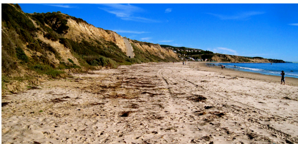
Crystal Cove State Park in Orange County, a natural beach with intertidal wrack brought ashore by waves and tides. Nicholas Schooler