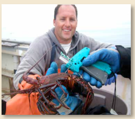
San Diego Oceans Foundation

Mendocino, which are oceanographically more linked to the frigid waters of the coastal Pacific Northwest. Each region of California has challenges and opportunities in coastal and marine resource preservation and management that surpass the state and federal resources available to them. The size and diversity of California and its population creates special challenges for statewide and regional policy development.