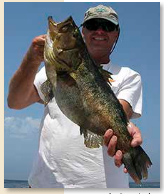
San Diego Anglers