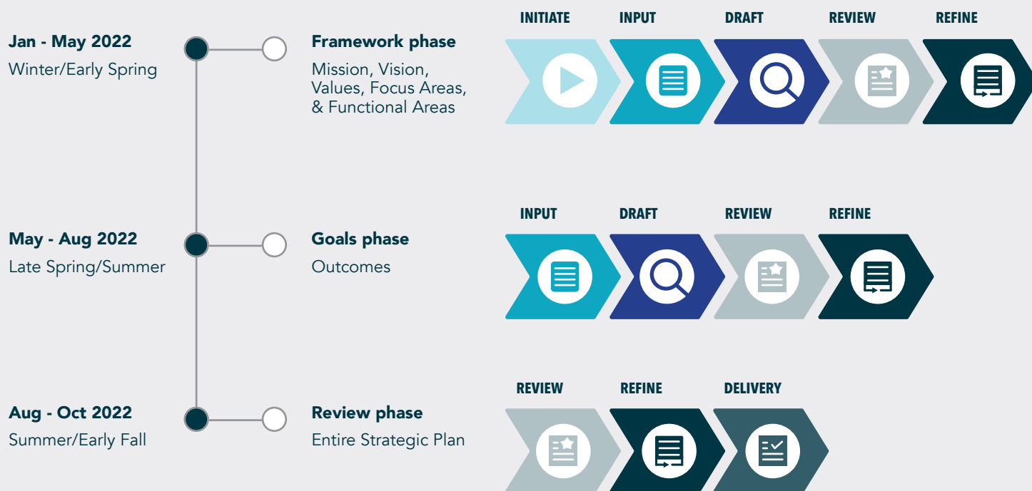
Figure 1. The California Sea Grant Strategic planning process that occurred from January to October 2022 and included the framework, goals and review phases.

by 3) the Review Phase which consisted of the review and finalization of the entire strategic plan. The process began with key California Sea Grant personnel and interested parties (Figure 2) and proceeded through to different California Sea Grant interested parties as the phases progressed. For example, California Sea Grant's internal and governing bodies, including the California Sea Grant Advisory Board and RASGAP (green and blue circles) were engaged in the framework and goals phases, while input from California Sea Grant partners, community and California citizens was included in the final review phase.