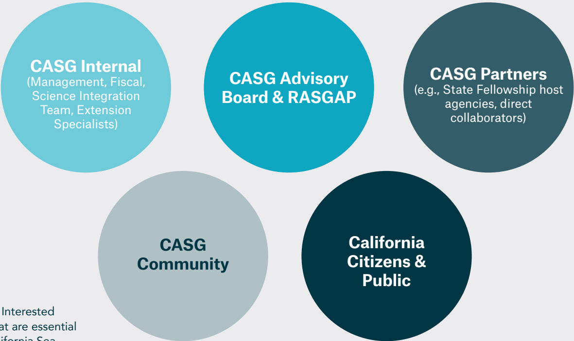
Figure 2. Interested parties that are essential to the California Sea Grant program and were involved in the strategic planning process.

The review phase served as an open comment period within which interested parties (Figure 2) had the opportunity to review and, in response to a survey, submit comments on the revised draft strategic plan which were then integrated into the final strategic plan.