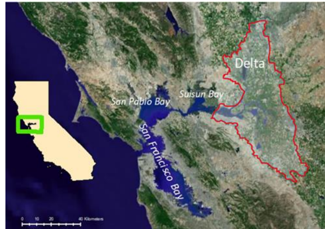
Location Map: Sacramento-San Joaquin Delta

The Sacramento–San Joaquin Delta (Delta), along with the San Francisco Bay, is part of the largest estuary on the West Coast. The Delta provides vital habitat for endangered and endemic species and is the portal through which important fish species, including anadromous Chinook salmon, pass on their way to and from their spawning grounds. The Delta is a major stop on the Pacific Flyway as well as the hub of the State’s water supply system, supplying two-thirds of California’s water supply. Thus, the Delta is inextricably linked to statewide water supply issues that affect its ability to function as a natural ecosystem.