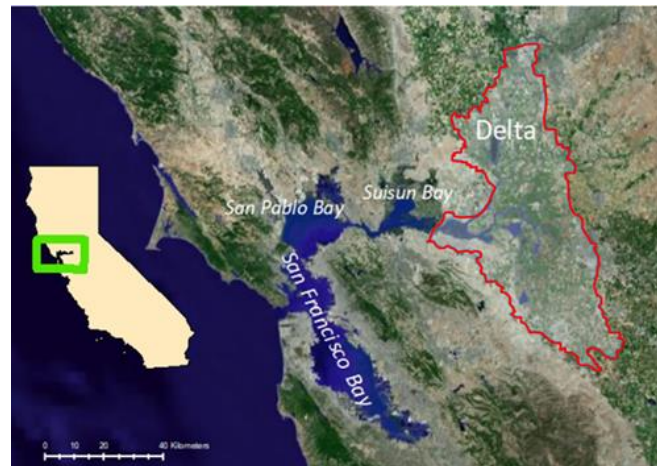
Location Map: Sacramento-San Joaquin Delta

The Sacramento–San Joaquin Delta (Delta), along with the San Francisco Bay, is part of the largest estuary on the West Coast. The Delta provides vital habitat for endangered and endemic species and is the portal through which important fish species, including anadromous Chinook salmon, pass on their way to and from their spawning grounds. The Delta is a major stop on the Pacific Flyway as well as the hub of the State’s water supply system, supplying two-thirds of California’s water supply. Thus, the Delta is inextricably linked to statewide water supply issues that affect its ability to function as a natural ecosystem.