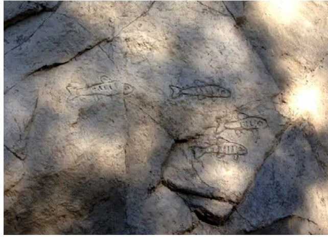
September 2016. Coho art incorporated into the project