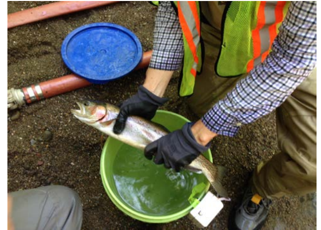
June 2016. Fish relocation