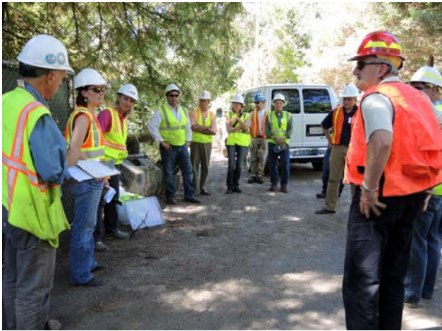
August 2016. NOAA tour of project