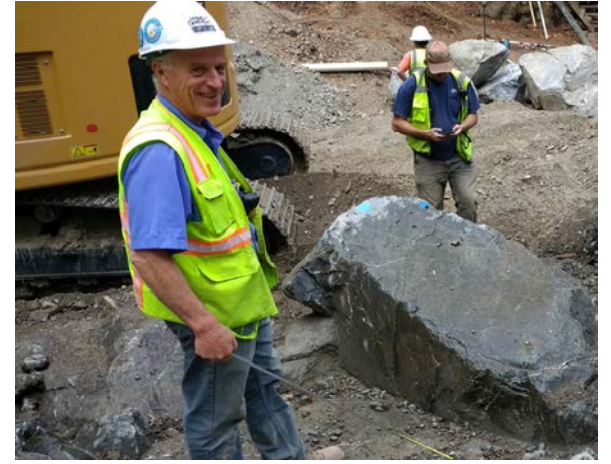
September 2016. Side channel inlet weir