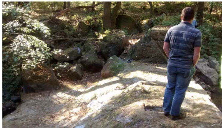
Pre-Project. Top of Mill Creek dam