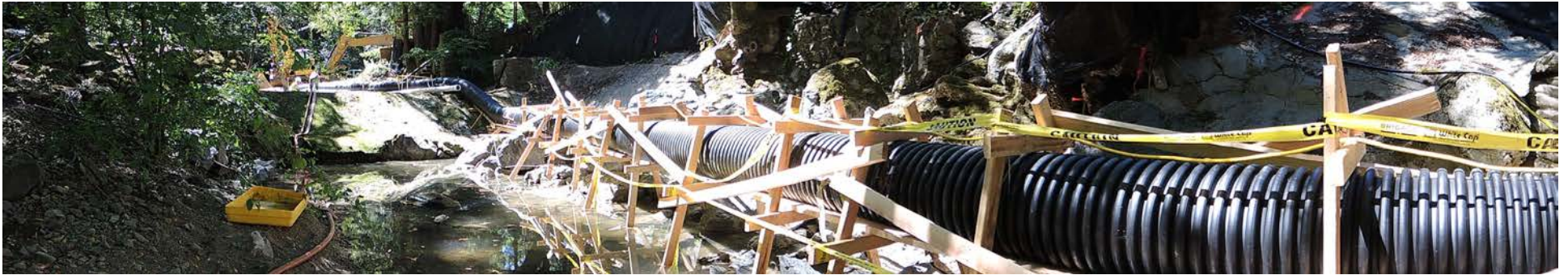
June 2016. Dewatering