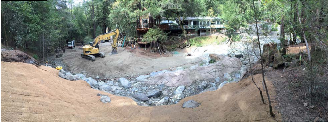
October 2016. Completing final channel work and erosion control