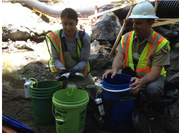
June 2016. Fish relocation