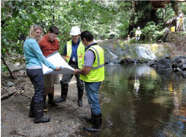
June 2016. Pre-Construction partner site meeting