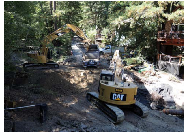
July 2016. Channel excavation