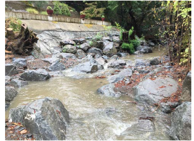
October 2016. First flows in the side & main channels