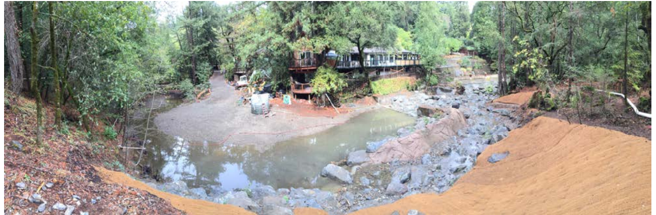
October 2016. First flows