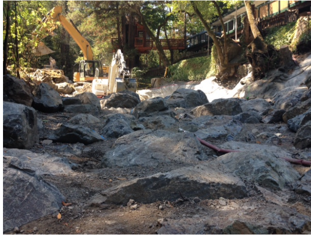
September 2016. Main channel bed construction