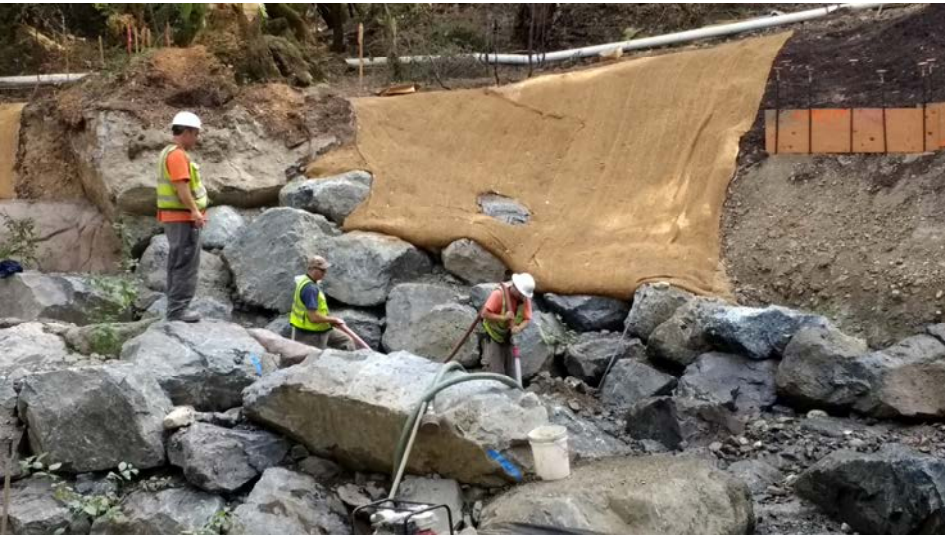
September 2016. Water jetting the side channel engineered streambed material