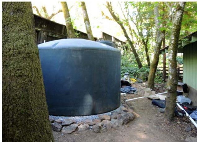
June 2016. Installed landowner water system