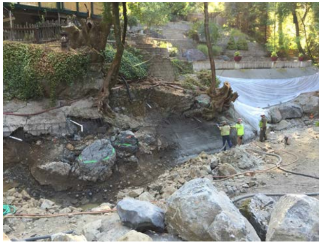
August 2016. Main channel shotcrete installation