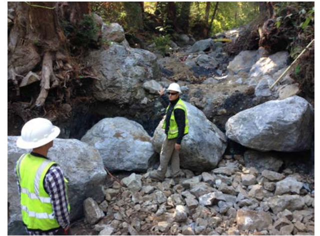
August 2016. Main channel engineered streambed material installation