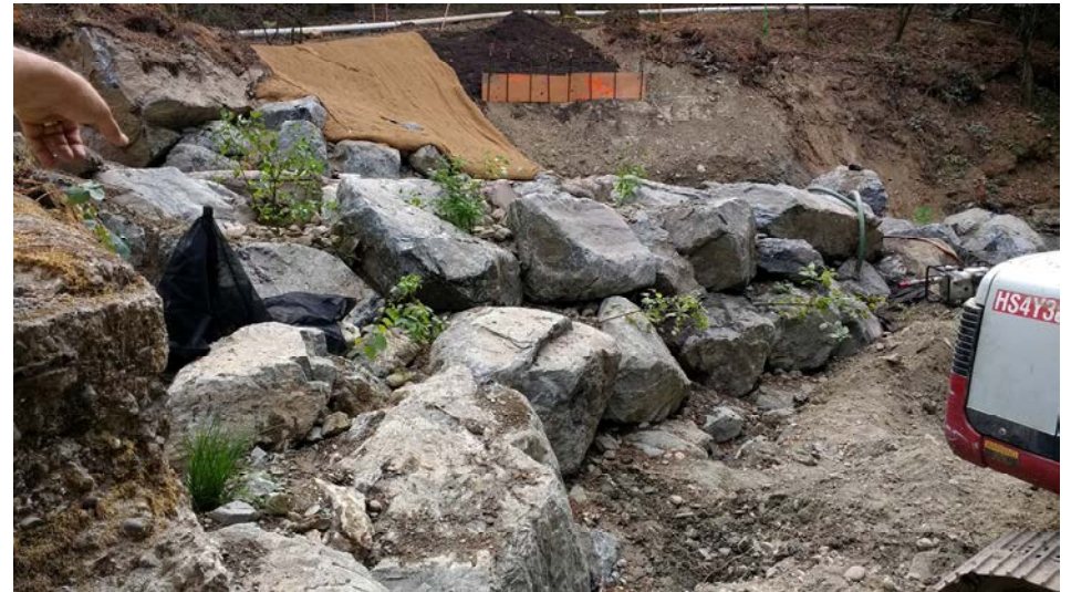
September 2016. Bifurcation island plantings