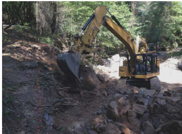
July 2016. Channel excavation