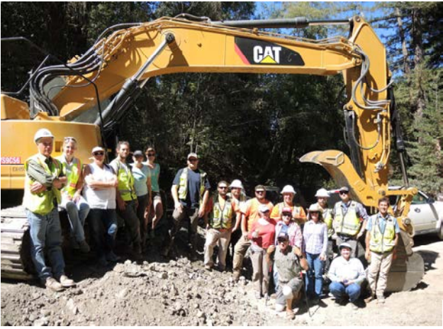
September 2016. Prunuske Chatham staff on site