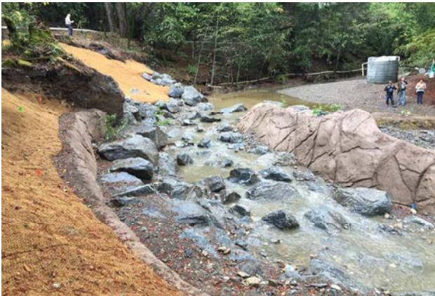
October 2016. First flows through side channel