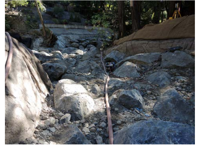
September 2016. Side channel bed construction