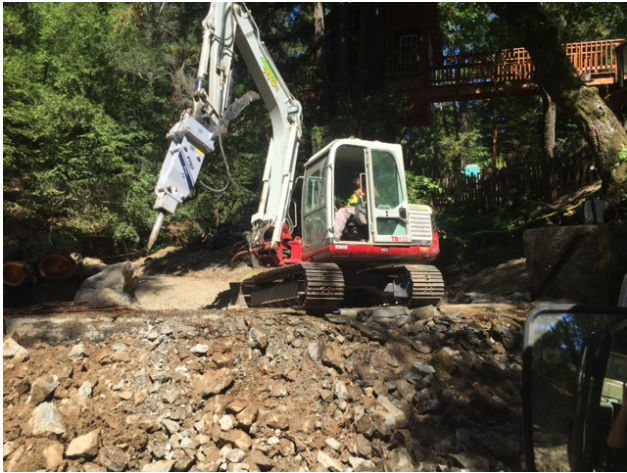
July 2016. Dam apron removal