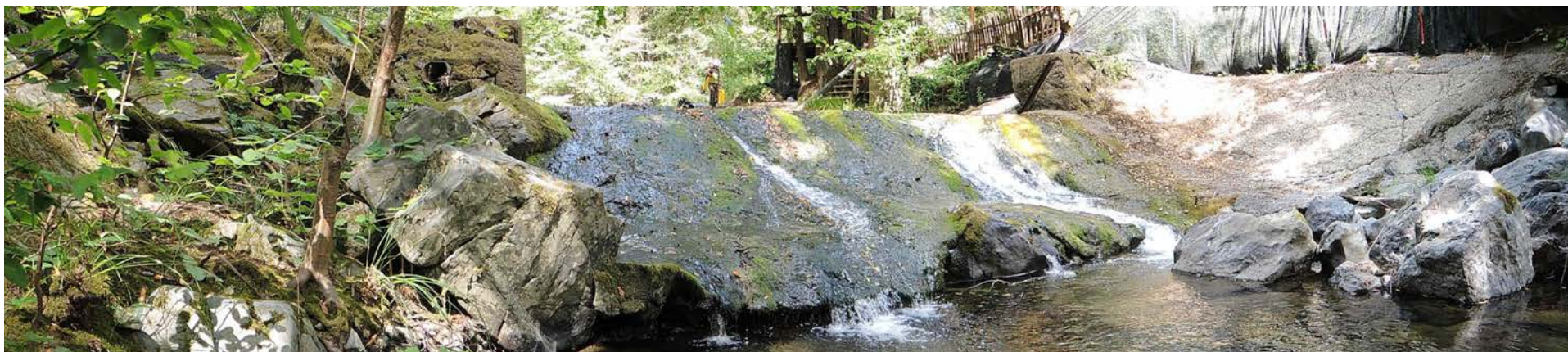
Pre-Project. Mill Creek dam panorama